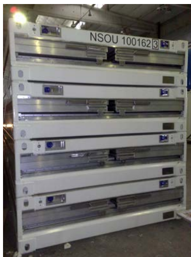
Stack of 4 shelters

The Multishelter weight is only 1500kg. 4 shelters are transported flat packed as a stack and can be set up in less than 5 minutes. No tools required!